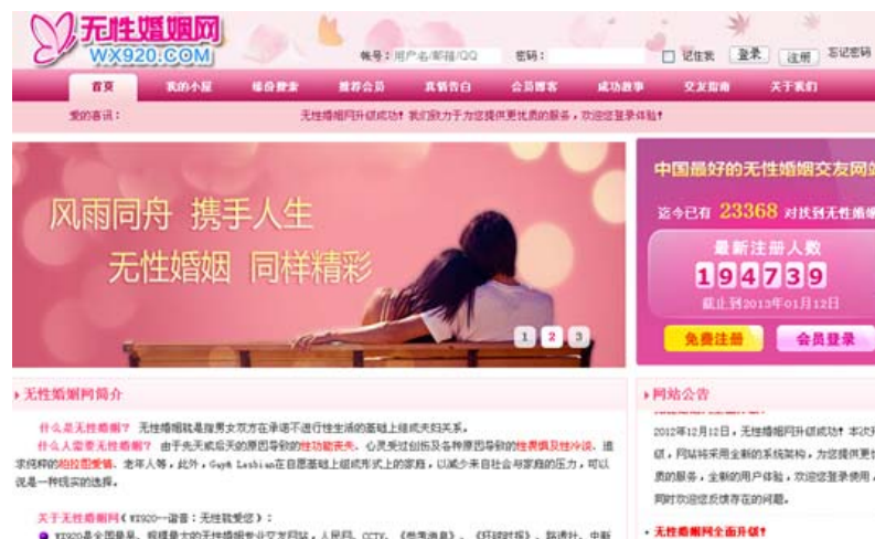
Figure 1.1: Homepage of WX920 dating site

This study will focus on the asexual matchmaking website of WX920, which was established as the first and biggest online asexual marriage broker in China (Figure 1.1). Launched by a technician with affiliation to the Chinese Communist Party in the southern province of Guangxi in 2005, this website has received extensive media coverage and attracted nearly 200,000 registered members. Its customers range from men and women who either have a low to non-existent sex drive or lack sexual functions due to biological impediments and psychological dysfunction, or lack sexual or romantic attraction to either gender. On this website, sixty percent of the site’s members are people who cannot have sex (Newsback 2006). The rest are sexual minorities, such as homosexuals, who seek to form a proforma marriage that refers to a marriage in form only without any sexual relationship in order to cope with family and social pressure. This research will primarily focus on those asexual individuals with sexually related disorders or diseases and investigate the issue by making reference to debates surrounding the sexual revolution and individualization in China.