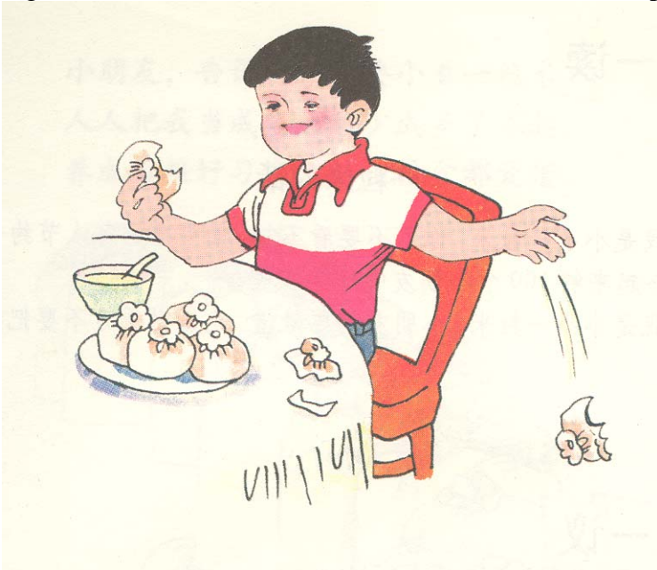
1.1 waste food: eat the meat filling and throw away the buns