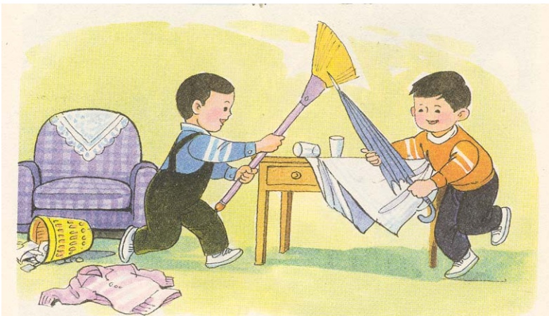
1.2 improper use of goods: fight with an umbrella and a broom